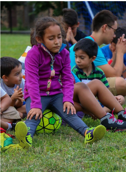
Young girl praying during soccer camp!

I was reminded that even though a child is loud and rambunctious, God is still moving in their hearts. Through our VBS classes and the Holy Spirit, he was still able to somehow capture the gospel. What a blessing it was to work with him!