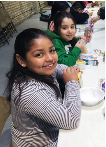
We served 3600 meals to children this summer!

As we move into the fall season we are looking to raise $50,000 to fill in the gaps we experience throughout the year when income dips and our services are in jeopardy of being shortened or cut. We creatively fund our activities but need to raise $160,000 a year through individual donors. Quite honestly we fall short of that number regularly. God always seems to meet those needs in some way or another, which keeps us humble and turning towards Him. Sometimes He provides through a boat that is donated or a supporter who is moved to give above and beyond what is normal support. We wonder how God will do it this year and wonder if you will be a part. Would you consider helping us reach that goal through a one time or monthly contribution?