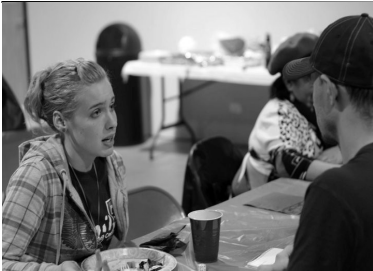
Conversation Night in ESL