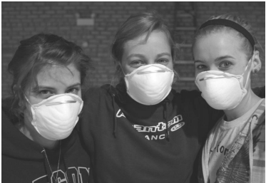
I am not going to even comment!

“THE KIDS WERE SO MUCH FUN”...MY ONLY QUESTION IS WHICH ONE IS THE KID?”