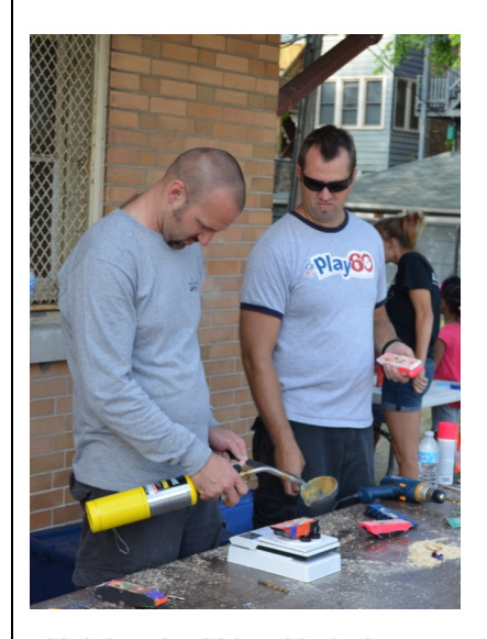
Helping the kids with their cars for the pinewood derby

"I love spending time with the children."