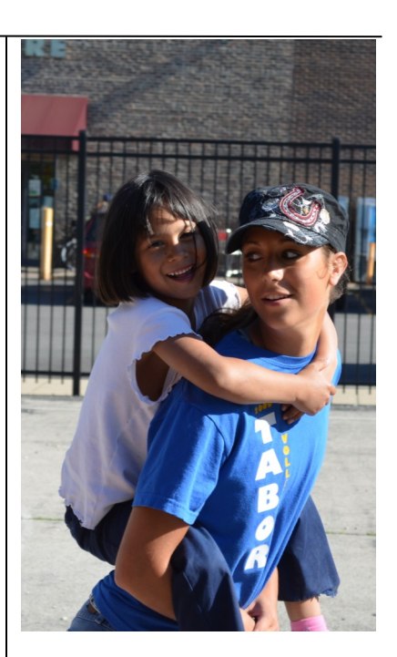
Loving on the kids of the community is part of the experience