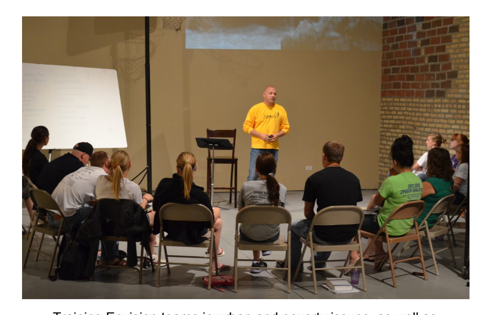
Training Envision teams in urban and poverty issues, as well as spiritual formation is one of the ways we look to empower the next generation.