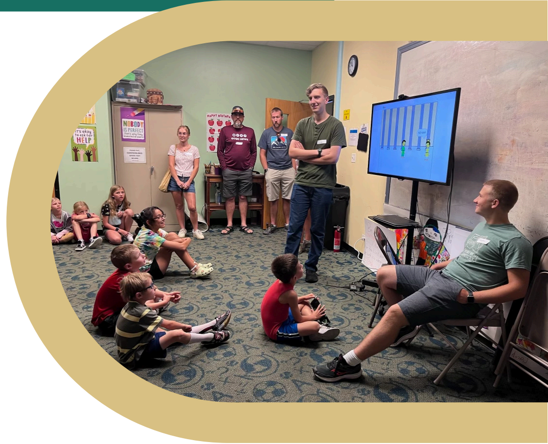
Watching a fun video about a hero of the Bible during day camp

An impactful experience I have had so far has been introducing Heroes of the Bible to our campers. I definitely lacked some knowledge on this topic, but along with the kids I have learned new stories about people in the Bible. I can proudly state that I have come closer to God as I have served in camp. It is encouraging to see how much time is dedicated to teaching the kids about God. It brings me joy to be a part of this camp where we prioritize the importance of our Creator, and it is special to be able to share the Word with kids who may not have someone to do this with them. I admire the hard work and engagement that the kids demonstrate when listening to the lessons. It inspires me to learn more so that I can share the word with more people. Overall, the kids at our camp have been able to spend quality time with friends and meet leaders who they create meaningful memories with.