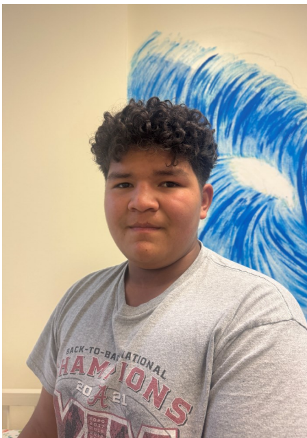
"This is my favorite place to be. I get help with my homework, get to hang out while volunteering AND learn about God."